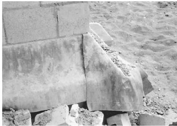
Figure 15-26 Unsealed lap joints allow water to circumvent the flashing.