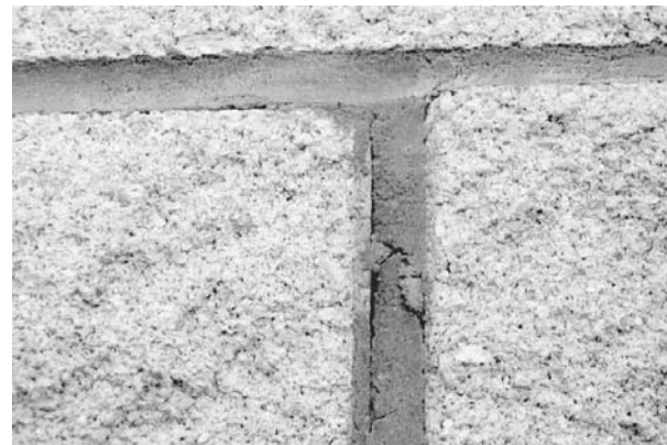
rough surface, bond line separations, voids